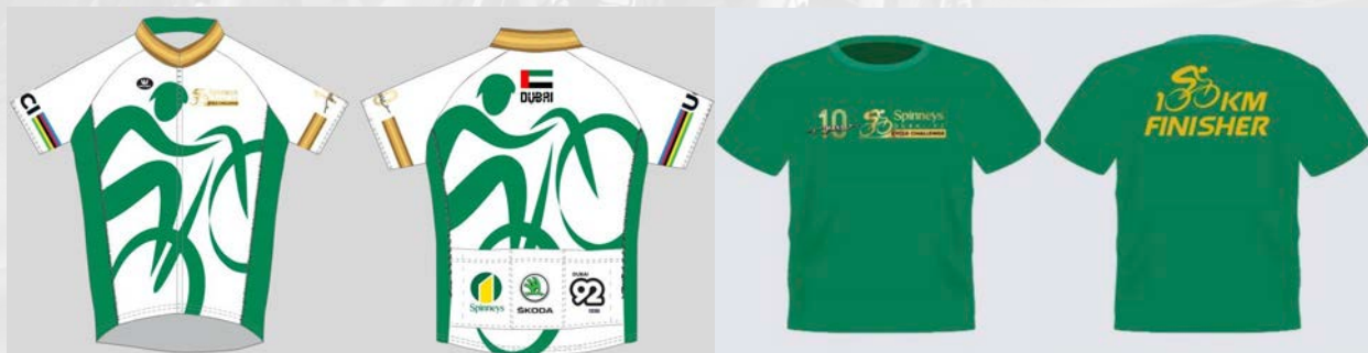
10 Year Anniversary Cycle Challenge Jersey

Refer a Buddy and win a T-Shirt: If you refer a buddy to register for the Cycle Challenge on Hopasports and you both complete the 100km Challenge, you will win a '100km Finisher T-Shirt' which you can collect from the Registration Tent after your race!