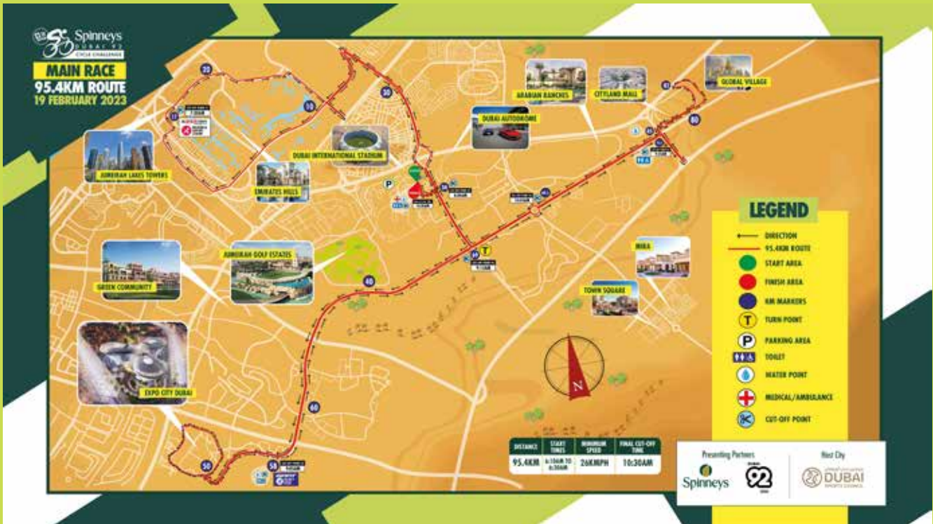
MAIN EVENT ROUTE - 95.4KM LOOP