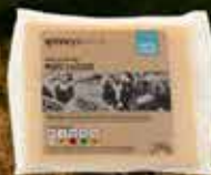
SpinneysFOOD White Cheddar