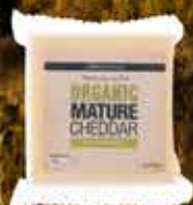
SpinneysFOOD Organic Mature Cheddar