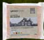
SpinneysFOOD Red Leicester